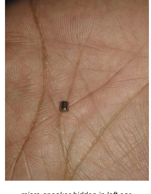
micro-speaker hidden in left ear