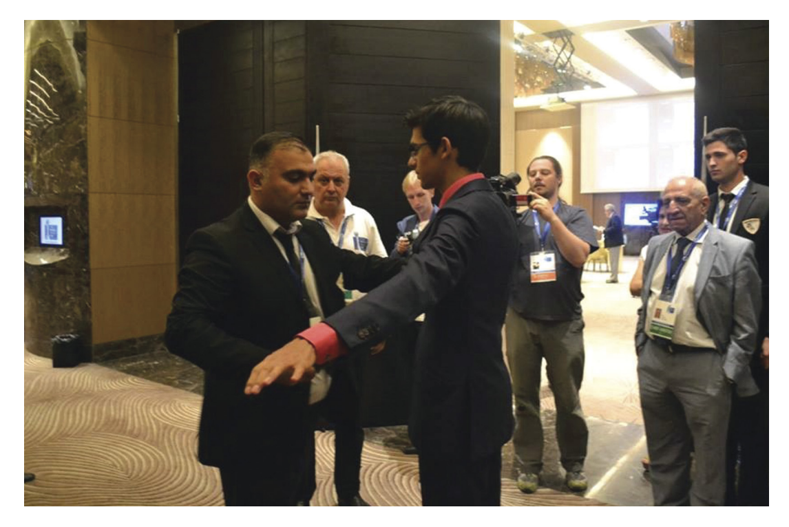
These new measures were presented to Arbiters at their Arbiters' Meetings.