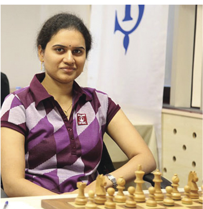
IM Tania Sachdev