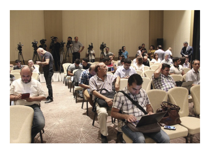
Looking back at the recent Baku World Cup, the Anti-Cheating Committee (ACC) and the World Cup Arbiters' team communicated extensively and cooperated closely. It is likely that this helped encourage widespread acceptance among all participants. There seemed to be genuine agreement on need to defend chess!