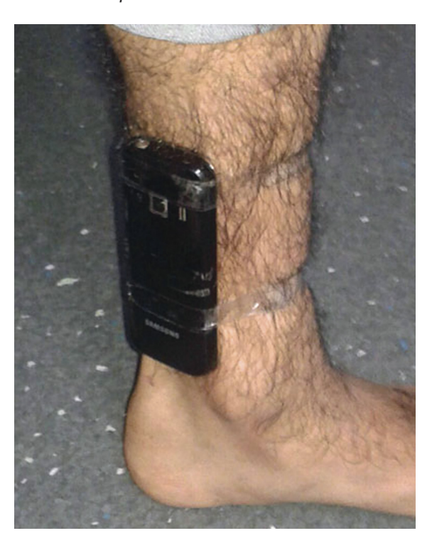
... and connected the other way to TWO phones, each one strapped with tape to a lower leg!