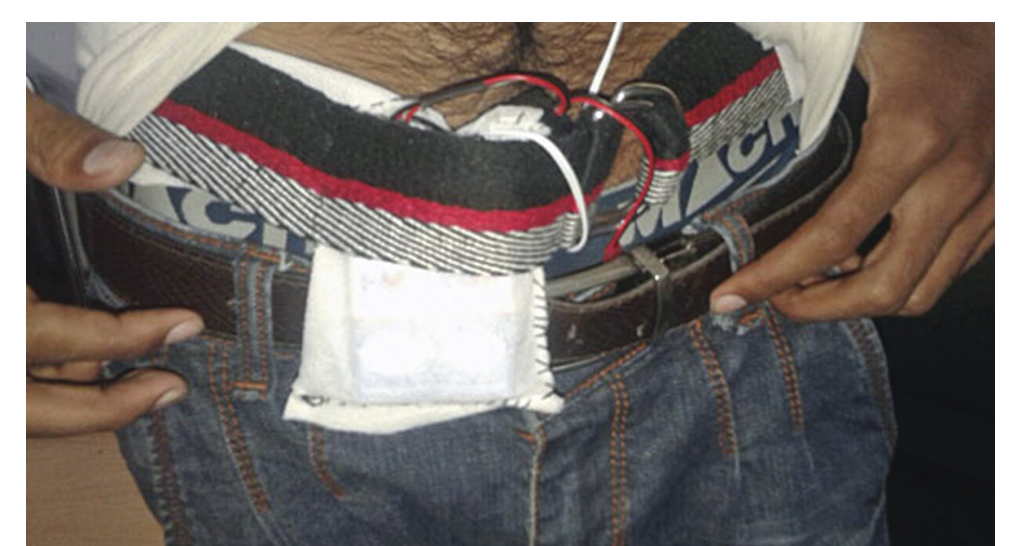
Two 9-volt batteries in a pouch, strapped to another belt, wires heading in both directions ...